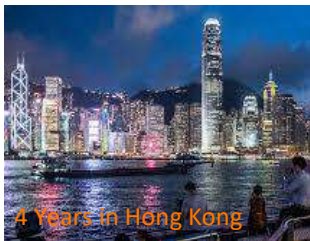
4 Years in Hong Kong