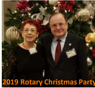
2019 Rotary Christmas Party