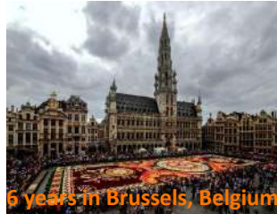
6 years in Brussels, Belgium