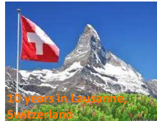
10 years in Lausanne, Switzerland