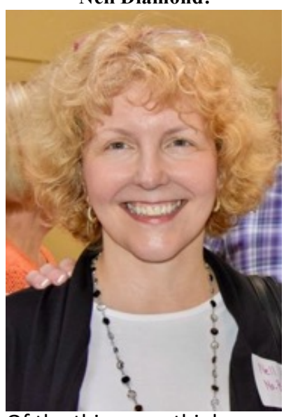
Of the things we think, say or do: