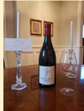
A Jeroboam of Domaine Serene 2017 Evenstad Reserve Pinot Noir.