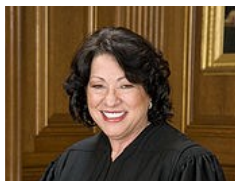
Sonia Sotomayor, Supreme Court Justice

September 15 to October 15 is National Hispanic American Heritage Month. This month traditionally honors the cultures and contributions of both Hispanic and Latino Americans as we celebrate heritage that is rooted in all Latin American countries. The Library of Congress, National Archives and Records Administration, National Endowment for the Humanities, National Gallery of Art, National Park Service, Smithsonian Institution and the United States Holocaust Memorial Museum are all working together in paying tribute to the