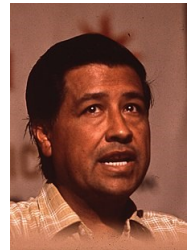
Cesar Chavez, labor leader

September 15 to October 15 is National Hispanic American Heritage Month. This month traditionally honors the cultures and contributions of both Hispanic and Latino Americans as we celebrate heritage that is rooted in all Latin American countries. The Library of Congress, National Archives and Records Administration, National Endowment for the Humanities, National Gallery of Art, National Park Service, Smithsonian Institution and the United States Holocaust Memorial Museum are all working together in paying tribute to the