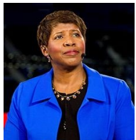
Gwen Ifill, journalist