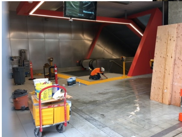
Photos of finishing touches to the U District Station.