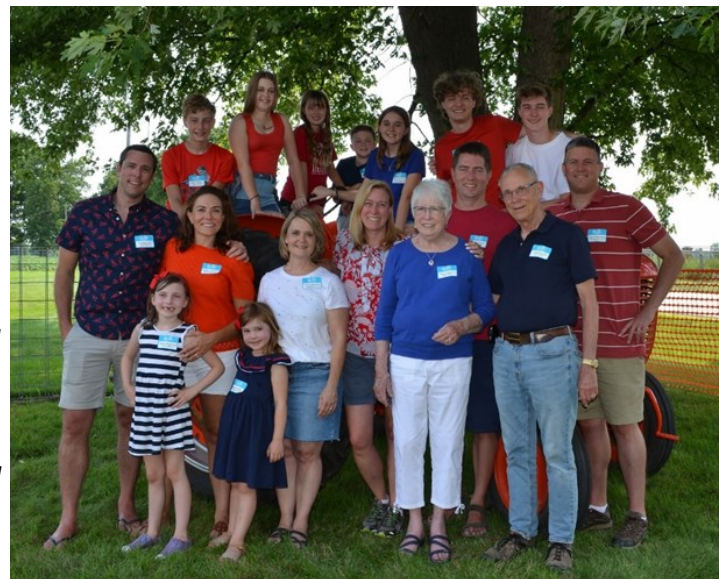
Family reunion 2021